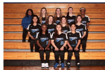
High School Softball