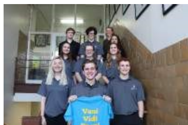
High School Scholastic Bowl