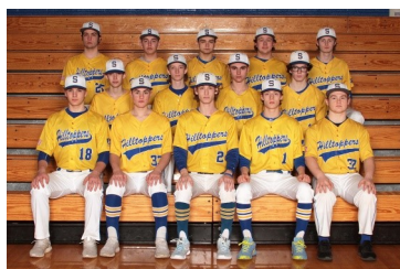
High School Baseball