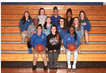
High School Girls Basketball