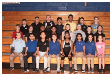
Jr. High Track