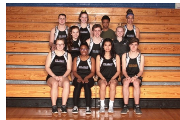
High School Track