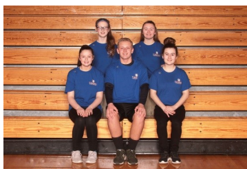
Jr. High Scholastic Bowl