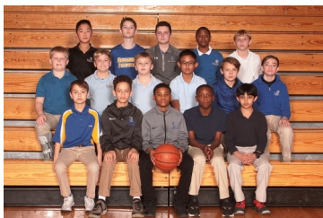
Jr. High 5/6th Boys Basketball