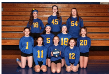
Jr. High Volleyball