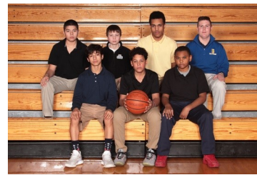
Jr. High 7/8th Boys Basketball