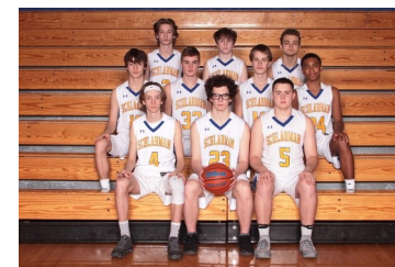
High School Boys Basketball